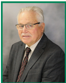
Bill Lear Central Area